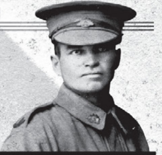
Lewis Harold Bell Lasseter Harold Lasseter's enigmatic claim of discovering a hidden gold reef in Central Australia in 1930 birthed the legendary, yet elusive, 'Lasseter's Reef', a mystery still unsolved and shrouded in intrigue.

So, we're embracing this quirky mystery with a twinkle in our eye. Have you heard a panther story or, better yet, think you've seen one? We'd love to hear about it! Share your stories with us over a cup of coffee and be part of an Aussie legend.