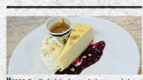
Macca New York plain cheesecake top w roasted macadamia nuts | whipped cream | warm caramel sauce | garnish berry compote 10