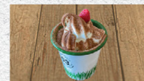
Bewdy Soft serve, chocolate powder & raspberry in 8oz enamel 6 Not available in all stores.